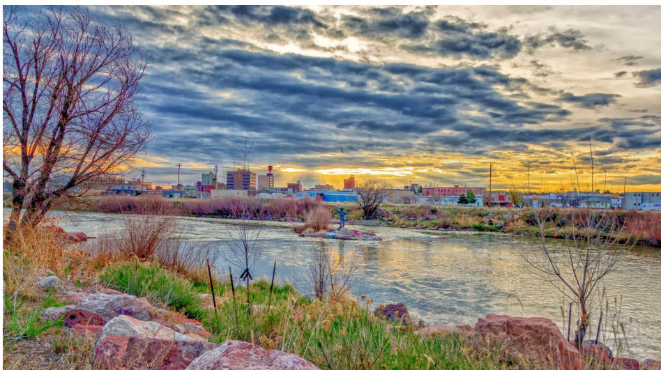
North Platte River at Sunset

We are required to provide written notice to the property owner of the violation, and they have 10 days to fix the issue. After 10 days, plus 3 days of mail transit time, a re-inspection occurs, and if the violation hasn't been taken care of, a citation can be issued, or the property can be referred to the City's contractor for mowing. The cost of mowing is then billed to the property owner. Average time to obtain compliance—18 days.