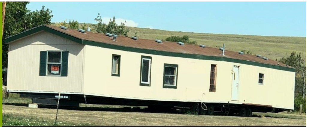
Abandoned Mobile Home left on Church Property without permission

A request for bids was issued to local demolition contractors. The lowest bid was accepted, and the structure is slated to be demolished this month. The cost of the demolition will ultimately be paid by the property owner, who has expressed appreciation for the City's assistance.