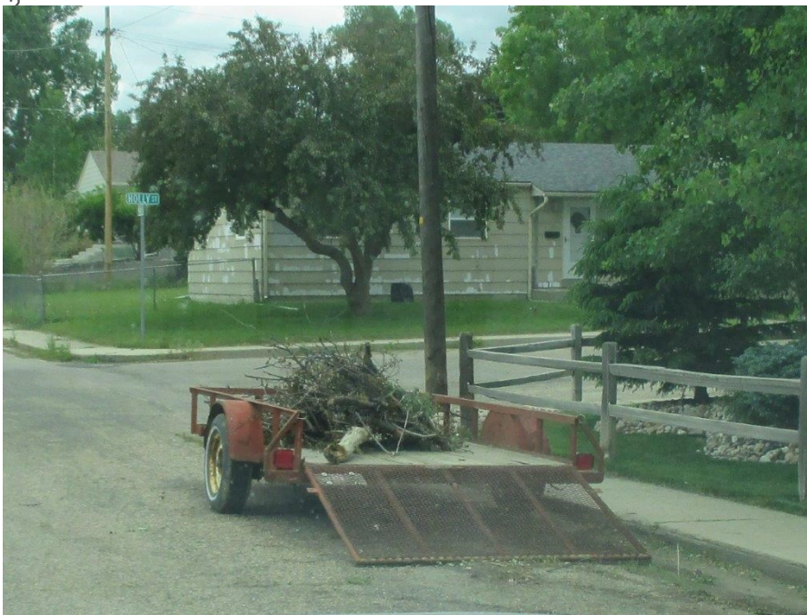
Previously Unregulated "Small" Utility Trailer