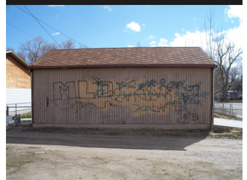
Recently tagged structure in Casper

Code Enforcement, in cooperation with the Police Department, have instituted an abatement program to assist property owners with the cost of removing graffiti quickly. A one page Graffiti Abatement Waiver is completed by the property owner, and they have the choice of having the City remove it, or alternatively, they are given a coupon that entitles them to a Graffiti Removal Kit, consisting of paintbrush, roller, roller pan, and 1 gallon of exterior paint in the color of their choosing. Costs for the program are paid by the Keep Casper Beautiful program.